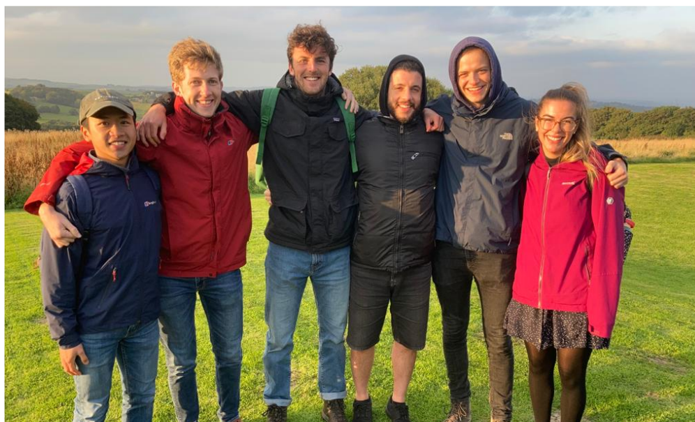
^Trainees in arms in hilly Sheffield.

Thank you for keeping me in your prayers these past couple of months. It's been a busy summer! I had a refreshing time back home leading at Cumbria Christian Youth Camp and also witnessed the wedding of my sister and now new brother-in-law! On returning to Sheffield we prepared for an online camp with some youth groups in Central Asia and studied Ephesians for a week. We enjoyed sharing our experiences of culture and knowing Jesus' together and encouraged by God's plan for the church.