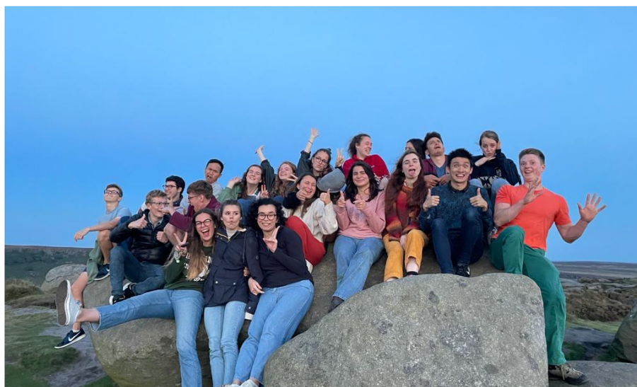
^Returner's Retreat in the Peak District

We had a blast at our Returners Retreat mid-September. We stayed at a girl guiding centre in the Peak District and it was good to reconnect with students after the summer break. While the accommodation was very modest, the company made the week. Our morning sessions took us through the book of Numbers with a sweeping view of our grumblings and unbelief against the God who deals perfectly with his people in faithfulness. In our afternoons we read a book about the messiness of relationships as a church and how to go about them in honesty and wisdom and with gospel-shaped vision.